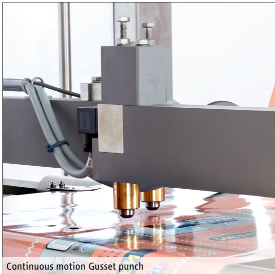
Continuous motion Gusset punch