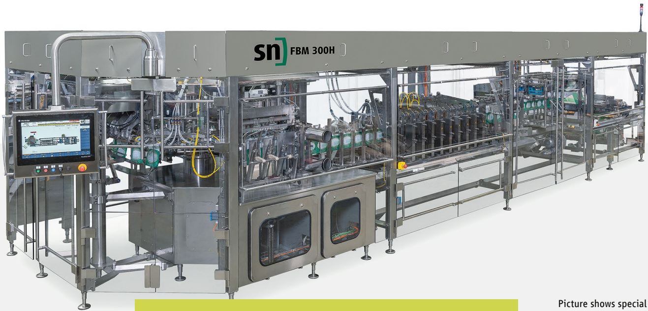
Picture shows special equipment